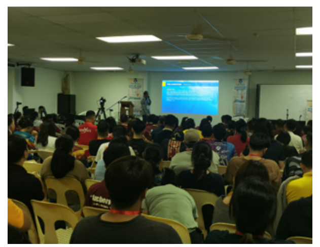
Pr Medellu during the main session