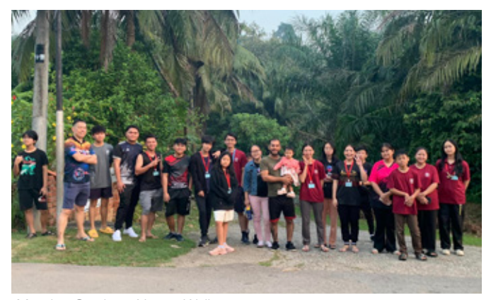
Morning Outdoor Nature Walk