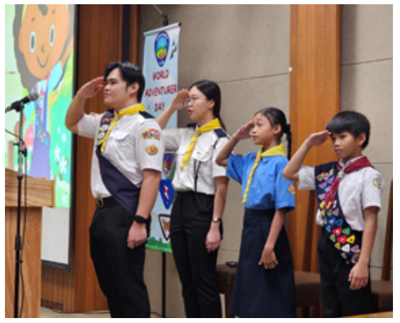
Nyanyian lagu kebangsaan, lagu Pathfinder dan Adventurer