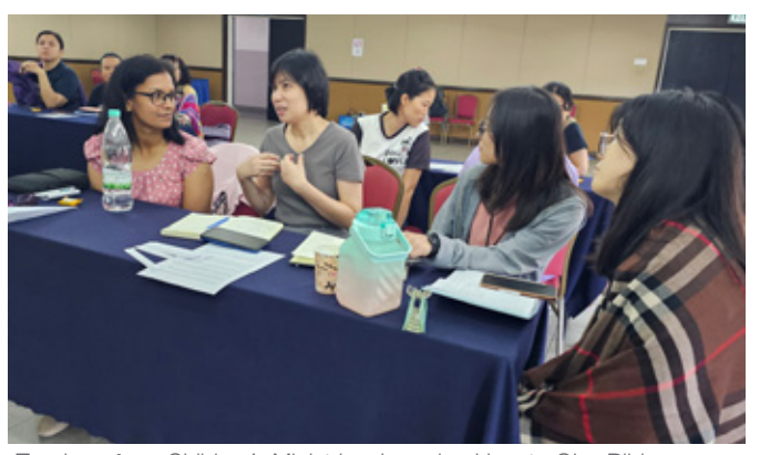
Teachers from Children's Ministries: Learning How to Give Bible Study to Children