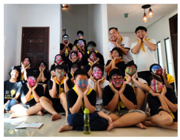
Group Photo - Animal Camouflage

Before departing, we all came together for a final act of service – a beach clean-up. Working together, Adventurers, Pathfinders, and parents ensured the campsite was left spotless. It may have been a bit tiring, but it was a small way to show our appreciation for the beautiful surroundings God has blessed us with.