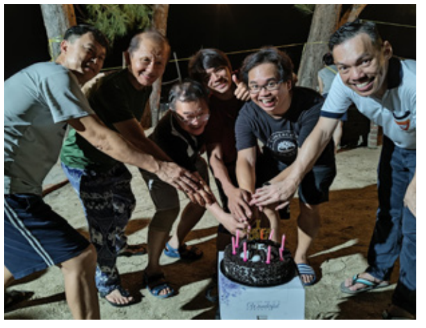
Special Father's Day Celebration during Campfire night