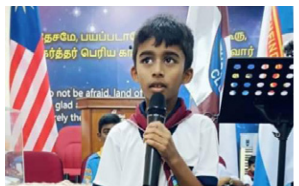
Adventurer special presentation

Thank you to all who participated and supported this wonderful event.