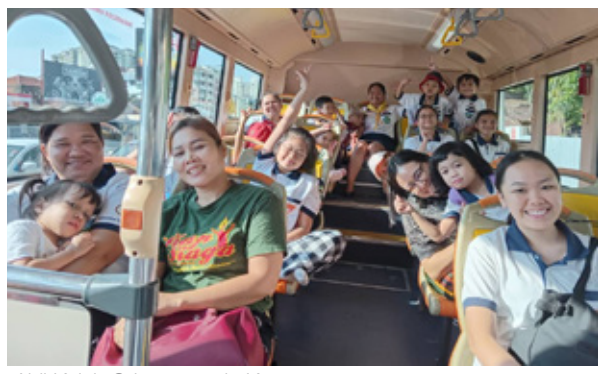
Ahli Kelab Orient menuju Komtar