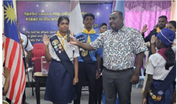
Reciting the Pathfinder Law