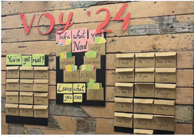
VOY Encouragement Board

Another special part of the camp was the prayer ceremony. We all wrote down things we were grateful for and prayers we wanted to lift up, and then symbolically burned them in a bonfire. It was a beautiful way to release our worries and trust in God's plan. The Sabbath was also a highlight, where we joined the Melaka SDA church for worship and fellowship. It felt amazing to be surrounded by such a supportive community.