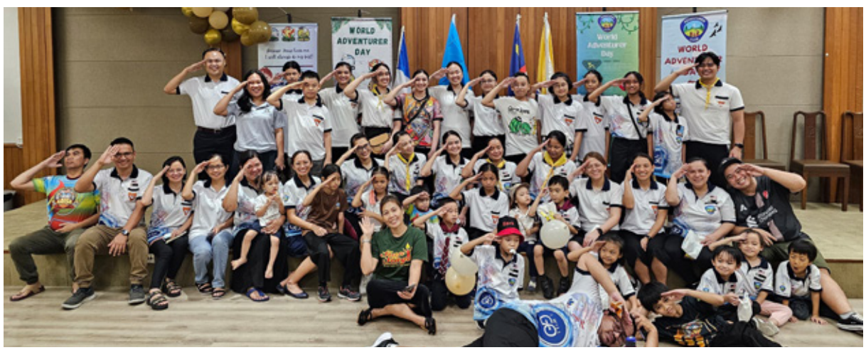
Gambar semua kanak-kanak yang mengambil bahagian

by MG Susanila Anak Nohik, Penang Adventist Hospital Church