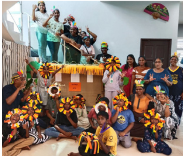
The participants and the volunteers

The VBS program ran from 9:30 A.M. – 1:00 A.M. Each day, we began with singing lively songs of praises to worship God our Creator. This was followed by the introduction of the animals from the African region, followed by 5 stations namely Bible stories, prayer, craft, games, and craft snacks stations.