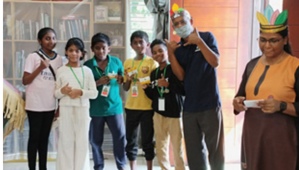
Re-enacting the Bible stories