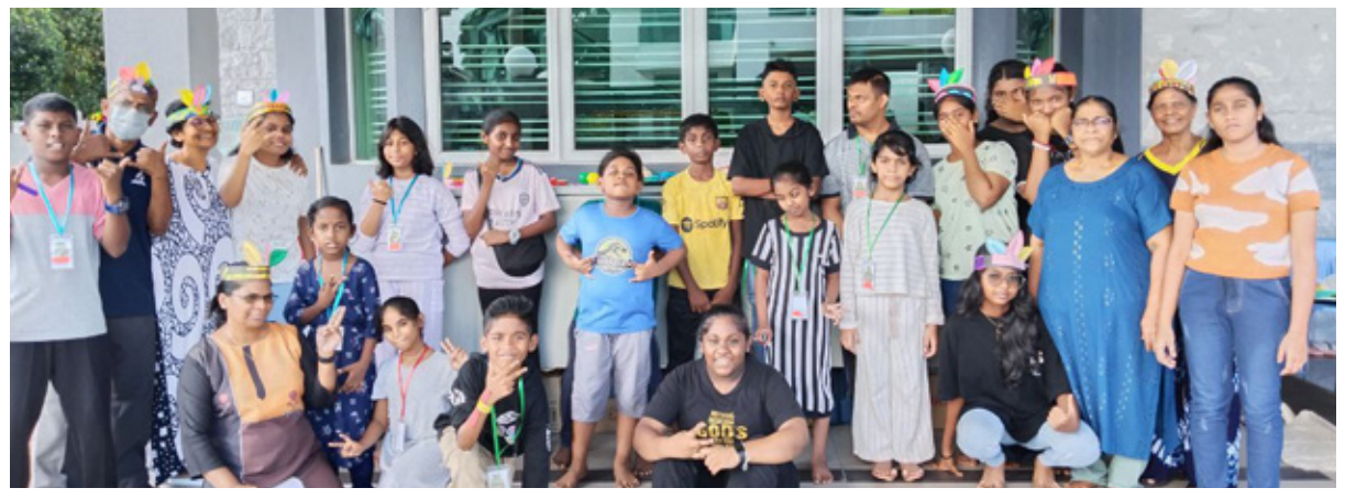
The Last Day