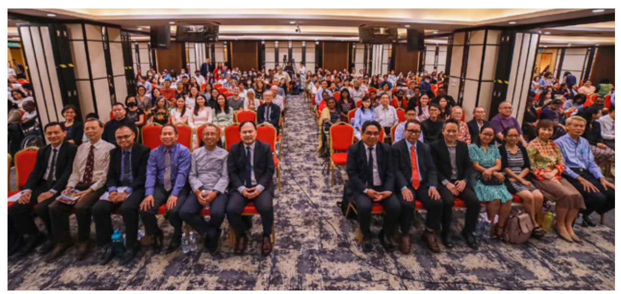
Group photo with the participants of the combined worship

May the Lord continue to grow the work here in Penang and all-over Peninsular Malaysia so that we may finish the work and Jesus can come to take us home. May God bless you and maranatha!