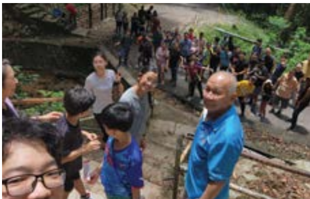
Morning hike with everyone

The SAHC Church camp weekend left everyone feeling closer to each other and to God. It was an opportunity to deepen our faith and to strengthen our bonds with the church family and with our invited friends outside of the church. In spite of losing our pastor and his family we know God who led us in the past will continue to lead us on.