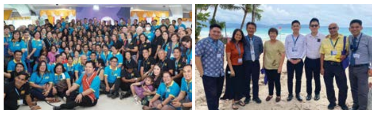
ASI Convention 2022