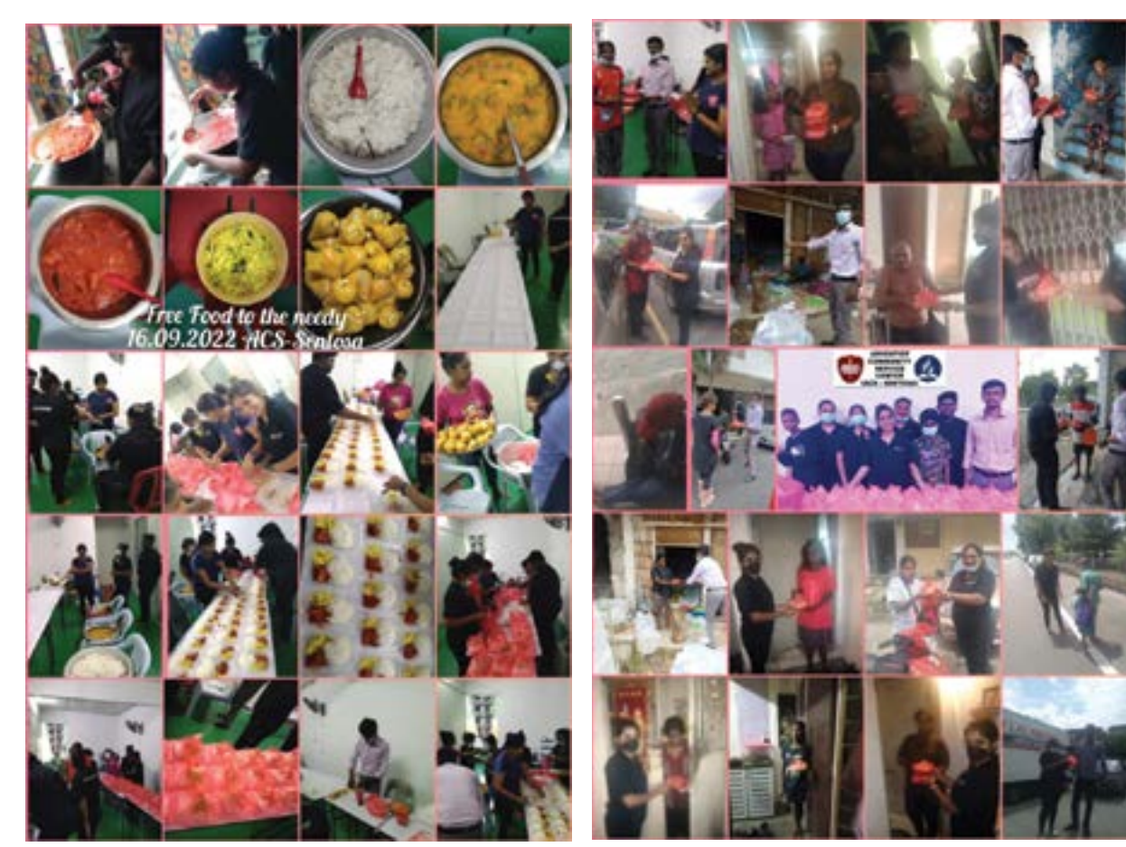
Cooking delicious Indian meals for the needy

On 16 September 2022, the newly formed Sentosa Adventist Community joined hands with a group of young people from the Bukit Jelutong Seventh-day Adventist Church to distribute meals to the needy around Sentosa, Klang. There are many poor and unfortunate people living on this side of Klang and hence, we wanted to help and share God's blessing.