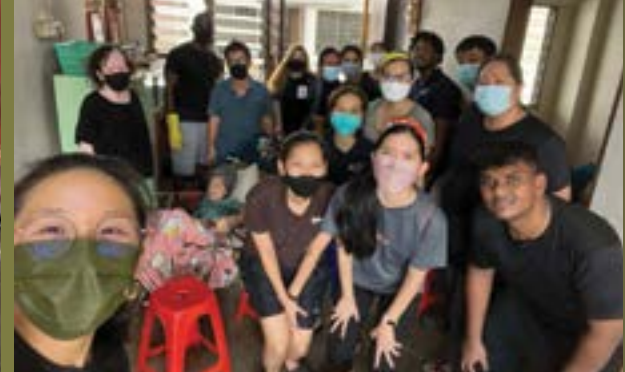
House cleaning for an unwell elderly or a