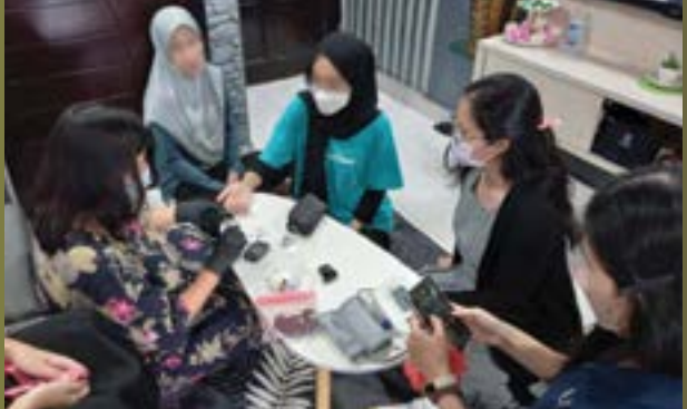
Door to door health screening in progress