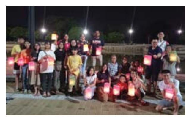
A group photo with our lanterns

Melaka Church is always very blessed. It is a home church to many faithful serving members all around the world and nearby. Even though it was a simple celebration, the get-together was enlightened and made extra special by visitation of old church members. We could feel the warmth and the closeness that we once had long ago.