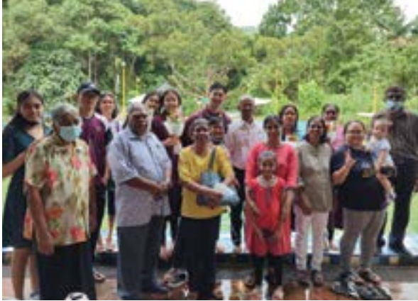
Celebrating the day with friends and family