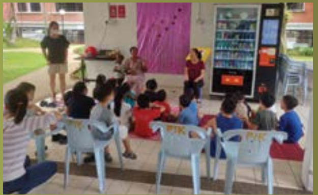
Joybox led by the mothers