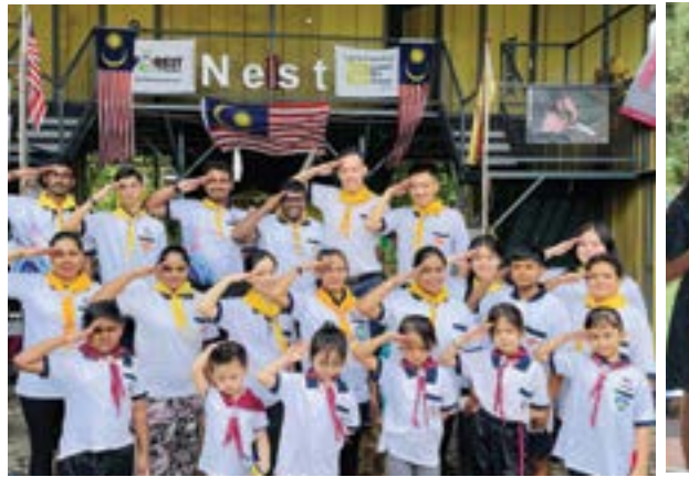
A group photo with with our beloved church Pastor

May God accompany every step they make, remembering that He will always go before them and be their constant companion. May every lesson they learned from their bible studies serves as a guide in their everyday lives.