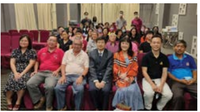
Group photo on the last day of the evangelistic meeting