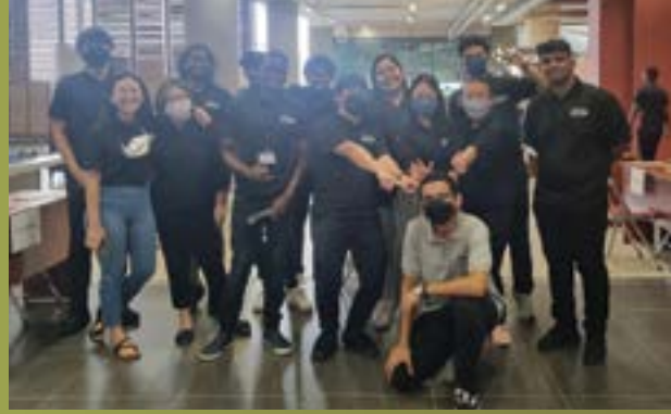
The health screening team on APU campus