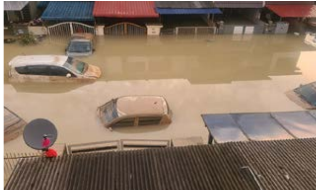
View of the flood from the roof

Here comes the devastating experience. Our great disappointment was due to the delayed response by the authorities to rescue victims during this disaster. Many were stuck in their houses for 3-4 days without electricity, food,