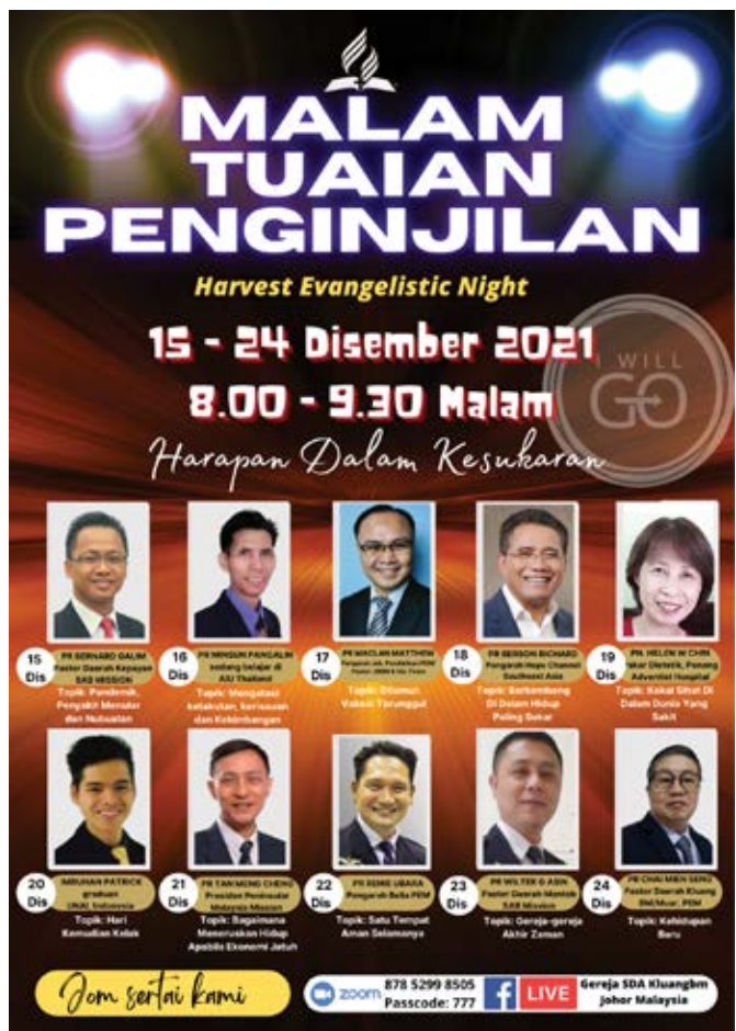
Poster of the event

Let's keep sowing the seed, continue working for God to harvest new souls for His kingdom. God bless.