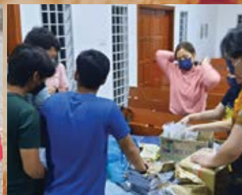
Preparing for the distribution