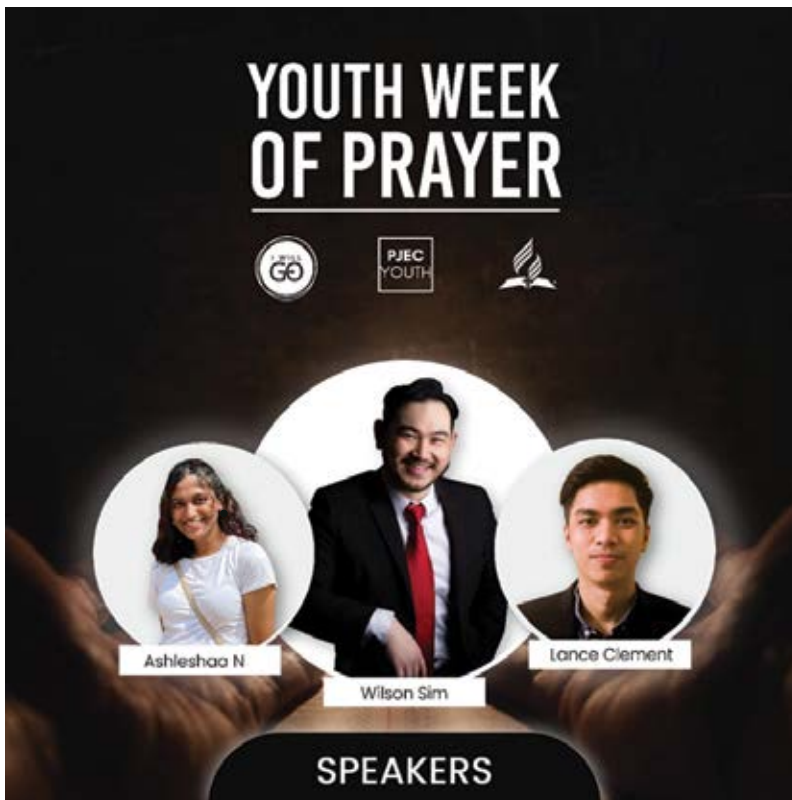
Youth Week of Prayer Poster