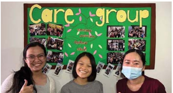
Care Group board