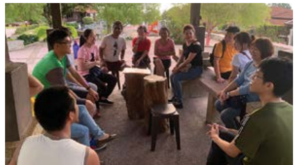
Outing with Care Group members