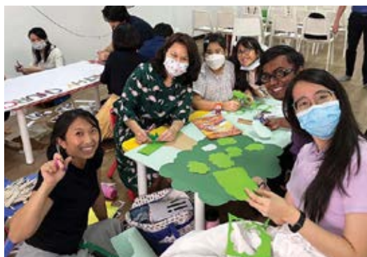
Suitable for all ages

Overall, this activity served many purposes – it was a fun activity that could be done by all ages, it is a feast for the eyes in the church hallway leading up to the sanctuary, and it made us reflect on the past and encouraged us for the future. Recommended for all churches!