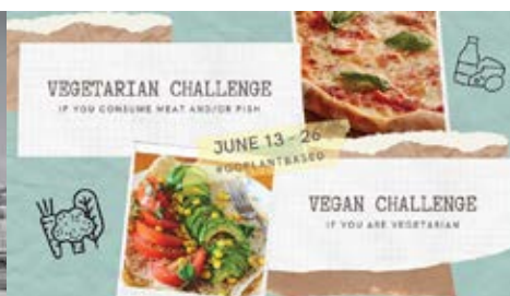
Vegan Vegetarian Challenge