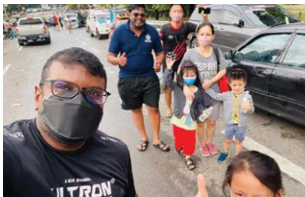
Group photo with the rescue team