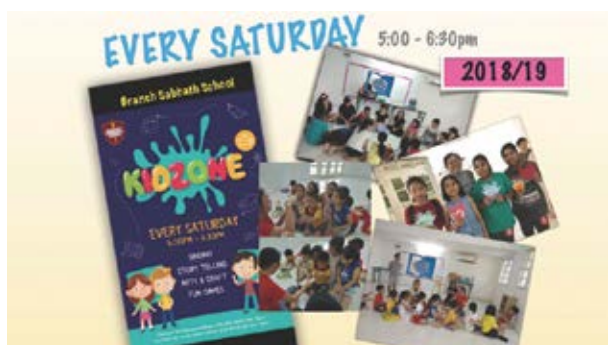
KidZone, a branch Sabbath School conducted during Sabbath

Another way of reaching out to the community was by organizing a program of free tuition, founded for young poor students from a nearby school, two-weekdays per week. Most of the volunteer teachers were our non-SDA friends from our Saturday meetings. These students were also given monthly food money at school. They were then invited to attend our branch Sabbath School on Sabbath afternoon. The adults were encouraged to attend the Win!Wellness while waiting for their children to be done with the Sabbath afternoon activity.