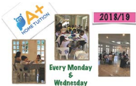
Tuition conducted twice during weekdays in ACF