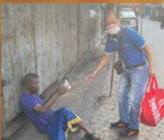
Distributing the items to the homeless by the roadside