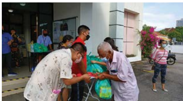
Red packet giveaway to the elderly