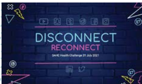
Disconnect to Reconnect challenge