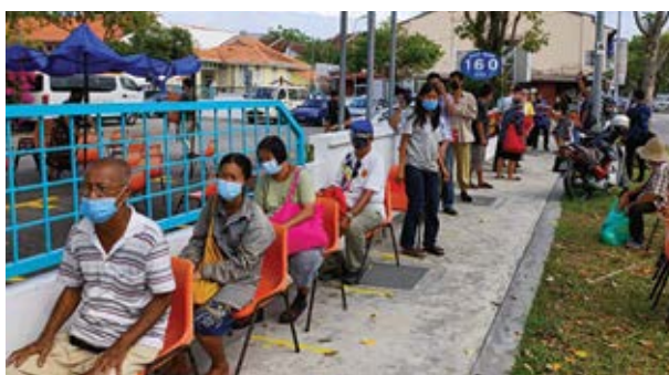
Long queue outside of the church building