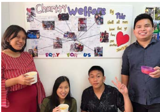
Welfare Ministry board