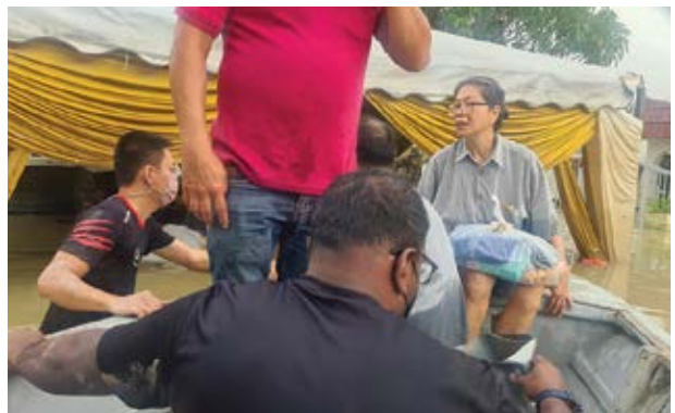
Rescue boat finally arrived to rescue Grandma Kam and my family