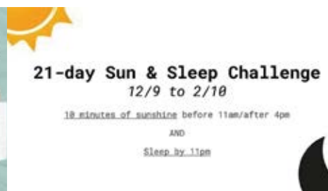
Sunshine and Sleep Challenge