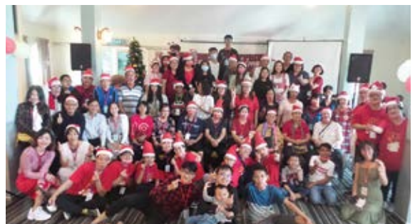
Christmas event with beloved church members

May this column remind us that great things come from humble beginnings, and in order to do great things for God, we need God Himself. It is not about competing with other churches or contending about who grows the fastest. We need to remember that we are on the same team with the same mission, serving the same Master. We are called to support one another and work together to spread the gospel throughout the Peninsular. May God bless each church in this region, and let's continue to plant more churches until Jesus returns again.