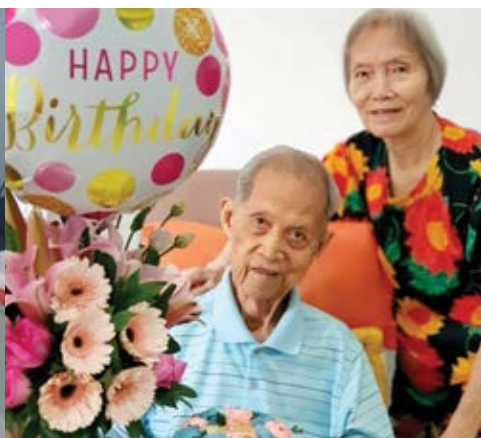
2021 妻子-颜师母（右）89岁生日 （新的生命4周年）