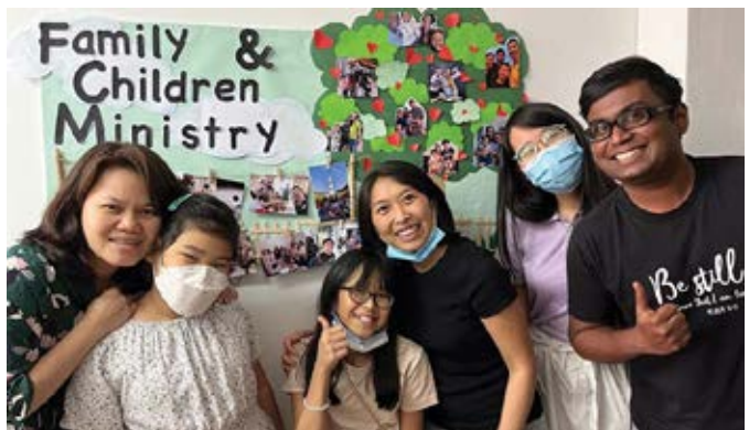
Family & Children Ministry board