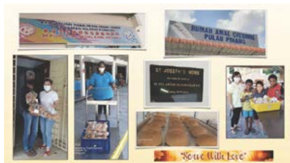
Bakery 5,000 distributing bread to the needy

We also, thank the Lord for a multitude of miraculous ways He has brought our small fellowship through and pray that we will be faithful and obedient to the great Gospel Commission with regards to Penang. ”