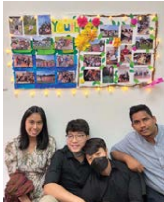
Youth Ministry board

Looking at the pictures in each category brought back memories of programs we forgot we had participated in and on people that we lost touch with over the lockdown. We took some of these pictures and sent them to the people in the pictures and managed to reconnect with them!