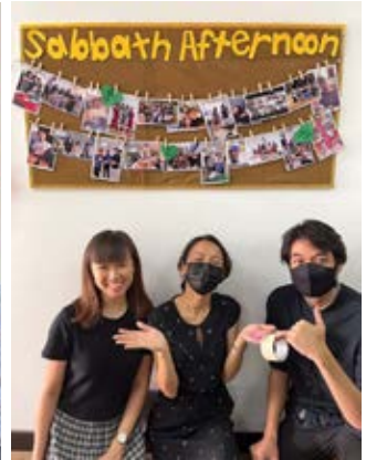
Sabbath Afternoon board