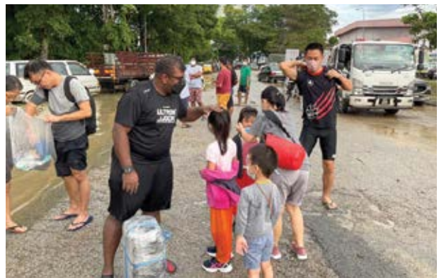
Finally reached somewhere safe