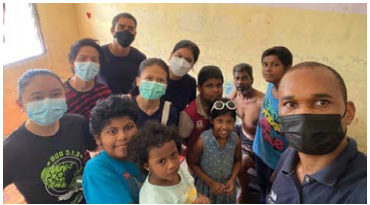
Group photo after 'gotong-royong'