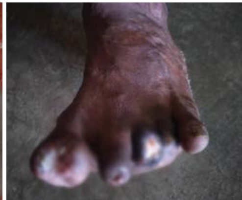
Uncle Ismail's wounds are recovering well with no infection