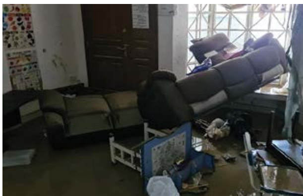
The flood damaged our belongings

I really hope a similar incident will not happen again. However, due to our sinful world, disaster will happen at a time we can't predict. Let us continue to be ready as this is the sign of the second coming of Jesus. Let's encourage, pray, serve, and help each other in times of need as this is what Jesus wants us to do.