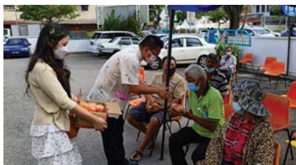
Giving away mandarin oranges to visitors