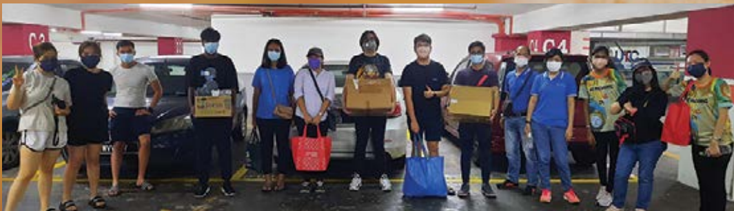
Group photo before distribution

We are looking forward to helping more homeless people in the future. Let's continue loving the forgotten! Praise the Lord Jesus!