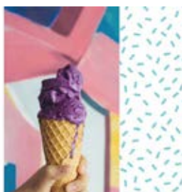
No Sugar Added Challenge