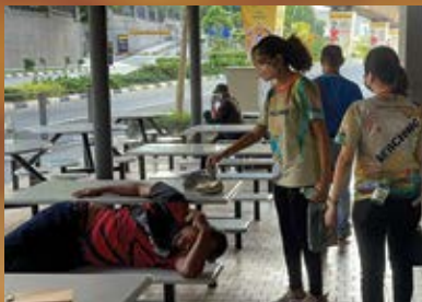
Distributing the items to the homeless