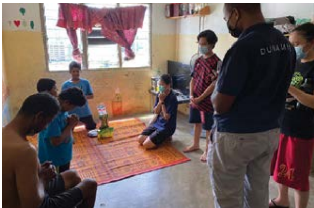
Praying together after 'gotong-royong'

Please keep us in your prayers as we hope to share more blessings and testimonies from Lembah Subang. God has blessed us greatly, and we pray that this article blesses you.