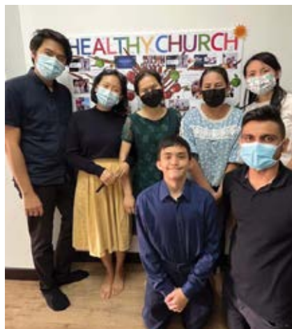
Health Ministry board