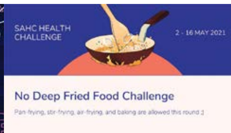
No Deep Fried Food Challenge